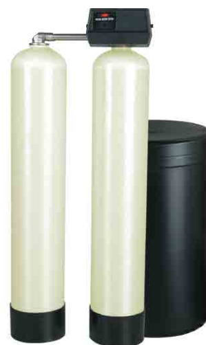
Series PWS10T Twin Alternating