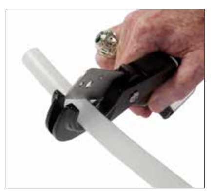
1. Cut tube at 90-degrees. Do not crush outside diameter of tubing with cutters. To achieve a clean cut, slightly rotate cutter during blade engagement.