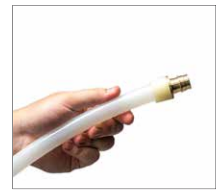
5. The installation is complete with a visibly secure connection. Remove defective connections. Test completed joint.