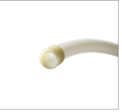
2. Install PEX sleeve onto outside diameter of tubing.