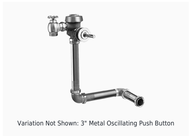
Variation Not Shown: 3" Metal Oscillating Push Button