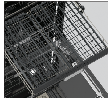
The adjustable third rack is ideal for flatware and serving instruments such as spatulas and other baking utensils.

SHARP ELECTRONICS CORPORATION 100 Paragon Drive, Montvale NJ, 07645 1.800.237.4277 • www.sharppusa.com