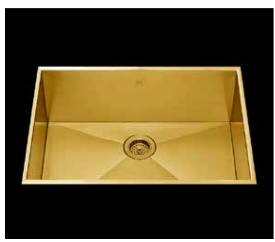
*Flush-Mount Installation Kit is included with each sink *Custom ADA compliant versions are available