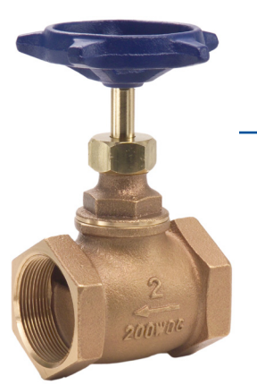
Pictured Model T-421