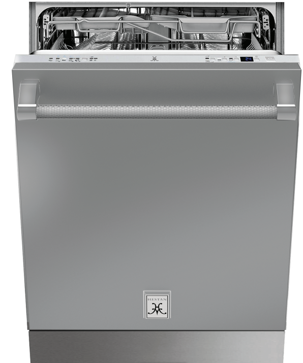
Model as shown KDW24