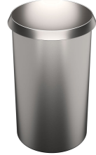
Bottle holder 1773 723