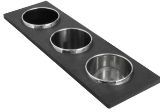
3 Bottles-holder set 8100 626